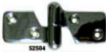
52504 : MOTOR BOX HINGE Brass chrome plated or S.S.