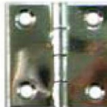
52585, 52586, 52587 52585 : 38 x 50mm 52586 : 44 x 50mm 52587 : 50 x 50mm