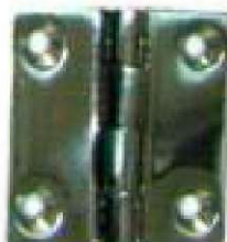
80182-01 : BUTT HINGE Size : 1-1/2" x 1-1/2" 80182-02 : BUTT HINGE Size : 2" x 2"