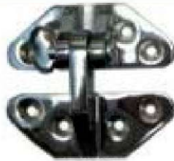
52507 : HATCH HINGE Brass chrome plated or s.s.