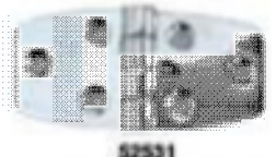
52531 : HINGE ( C.P.B. ) Size : 76 x 38mm