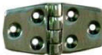
80183 80183-01 : DOOR HINGE Size : 1-1/2" x 3" 80183-02 : DOOR HINGE Size : 1-1/2" x 4"