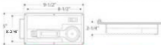
4131 All-Deck Shower - Hot / Cold

Corner with 9" base, stainless steel hot water mixing cartridge. Fits over inboard freshwater system for showering.