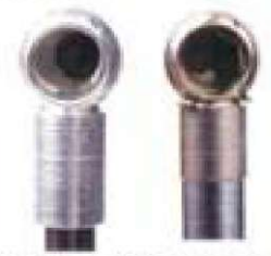
Ni-Slide Stainless Steel