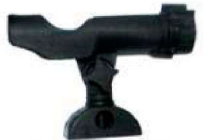
54079-2WH & 54079-2BK 54079-2WH & 54079-2BK Made of P.P. Adjustable Rod Holder with Side and Deck Mounting Bracket