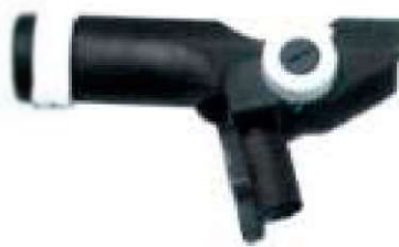
54077-SIDE : ROD HOLDER Side Mount.