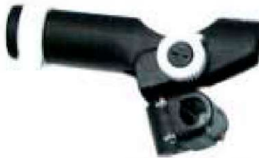
54077-RAIL : ROD HOLDER Rail Mount

54069 : PLASTIC ROD HOLDER Flange Dia. 4 1/8" x 3 1/2" Overall length : 9 1/2", I.D. 1 5/8"