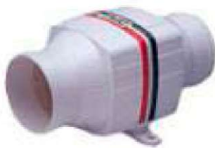
TMC-03703 & 03705

TMC-03701 : BILGE BLOWER 12V 3A Air 2500 Liters Per Minute ( 90CFM ) 76MM (3") Intake Pipe, Spark Proof.