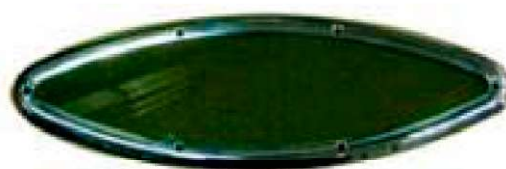
13620-SS 13620 : SS PORTHOLE Size : 5" x 15"

13628-P : Oval Port White nylon frame, Tempered glass Frame : 18.7" L x 8.2" W Cutout : 15.5" L x 5.2" W