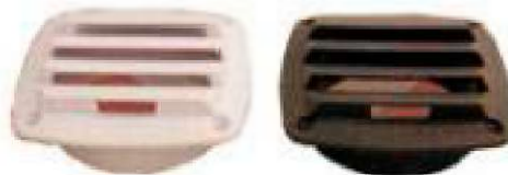
135340-W & 135340-B