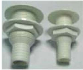
PLASTIC THRU-HULLS Sizes : 5/8", 3/4", 1", 1-1/8", 1-1/4" & 1-1/2"