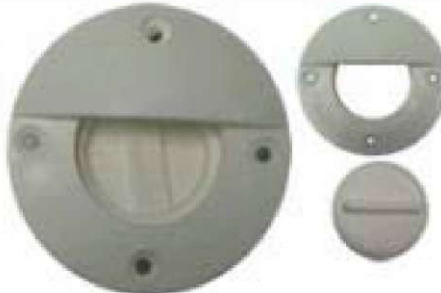
4920 DRAIN SOCKET O.D. 90MM, I.D. 45MM