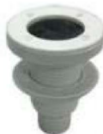
43245 : DRAIN SOCKET WITH VALVE