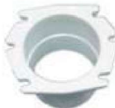
13535 & 13536