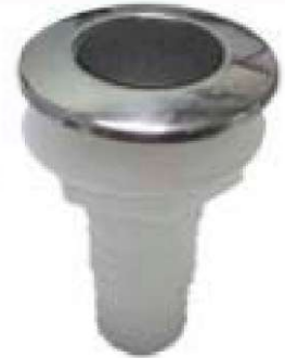
Thru-Hull Connector SS304 Flange w/white Plastic with Flapper Valve, 1-1/2" & 1-1/8"