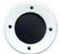
ART. 4916 : DRAIN SOCKET