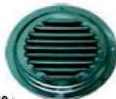
77260 : SS ROUND LOUVERED VENT 5" Dia x 1mm Thick.